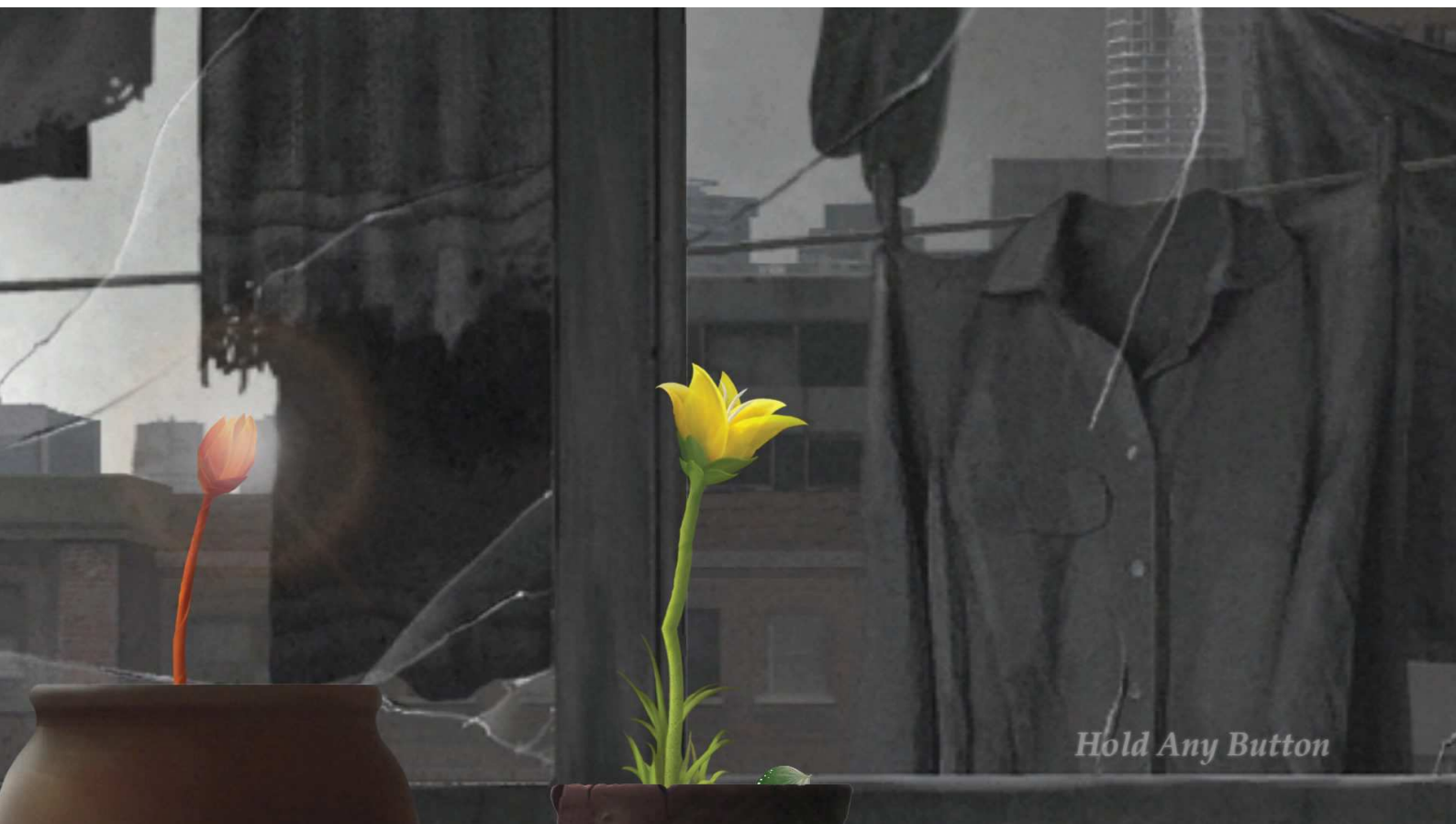
Illustration no. 1. Flower , Thatgamecompany, 2009

linguistic, iconographic, aural, or kinetic.” 19 In the context of video games, it makes sense to ask whether the polysemiotic catalogue indicated by Szczęsna might not need to include an interactive factor – activity on the part of the user that does not fall within the categories of reception or the act of interpretation. This idea is usefully illustrated by the game Flower . 20 I am using this particular example because Flower is one game in which linguistic signs do not figure at all (except for a small number of non-diegetic panels in which the game’s logo is presented or some lapidary user instructions on how to play – not actually part of the game’s universe). I believe that will allow us to productively examine the specifics of how metaphorical discourse can express itself separately from the medium of language .