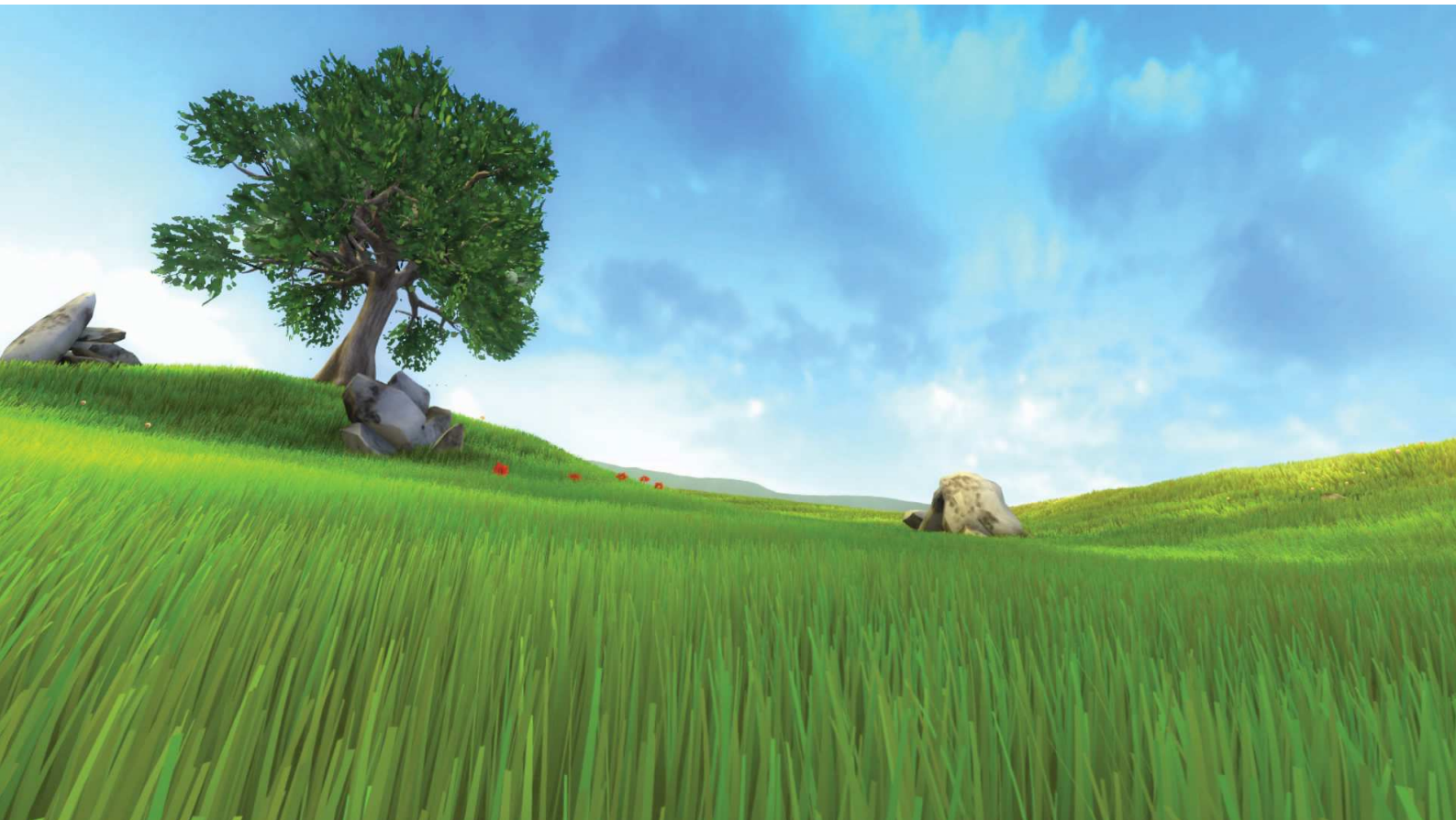
Illustration no. 3. Flower , Thatgamecompany, 2009

player begins to whirl around and hits the ground in a dense torrent right near the tree's desiccated trunk. Then a flower grows there (just like the one at the beginning of this stage), and the whole hill becomes covered with vibrantly coloured plants, while the tree instantly grows green and comes to life.