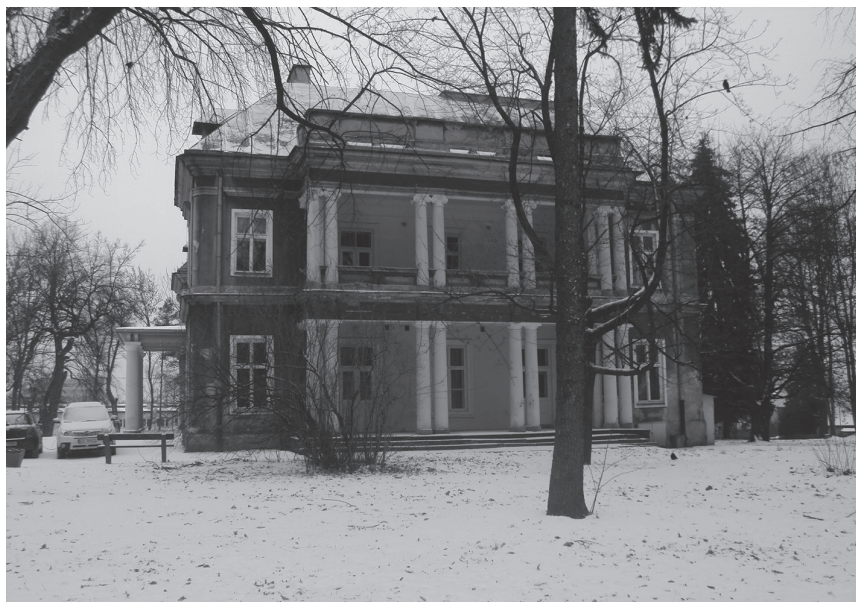
Fig.3. Former Jędrzejowicz palace, currently regional centre of pulmonary diseases. Current state.