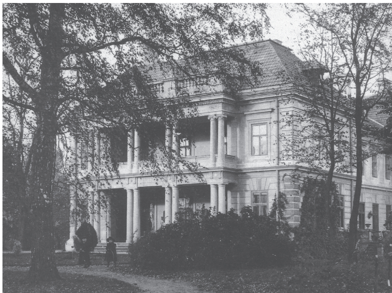
Fig.2. Jędrzejowicz family palace in Staromieście. Picture taken by Edward Janusz between 1896 and 1918. Courtesy of Krzysztof Szela, director of Regional Museum in Rzeszów.