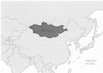
Figure 3. Nuclear-Weapon-Free Zone in Mongolia

On 3 February 2000 the Parliament of Mongolia adopted and entered into force document "Law of Mongolia on its nuclear-weaponfree status".