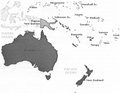
Figure 1. Nuclear-Weapon-Free Zone in South Pacific

The Treaty of Rarotonga entered into force on 11 December 1986, upon the deposit of the eighth instrument of ratification. 18 The zone encloses area of 13 states-parties: Australia, Cook Islands, Fiji, Kiribati, Nauru, New Zealand, Niue, Papua New Guinea, Samoa, Solomon Islands, Tonga, Tuvalu, and Vanuatu (see Figure 1). 19