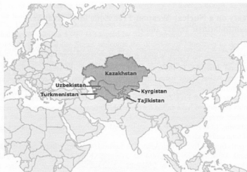
Figure 4. Nuclear-Weapon-Free Zone in Central Asia

nuclear weapon or other nuclear explosive device, not to seek or receive assistance in any of them, or assist in or encourage such actions. The receipt, storage, stockpiling, installation, or other form of possession of any nuclear weapon or nuclear explosive device on the territory of the member states is not allowed. Each party pledges not to carry out nuclear weapon tests or any other nuclear explosion and prevent any such nuclear explosion at any place under its control. The parties agreed not to allow the disposal on their territory of radioactive waste from other states. 28