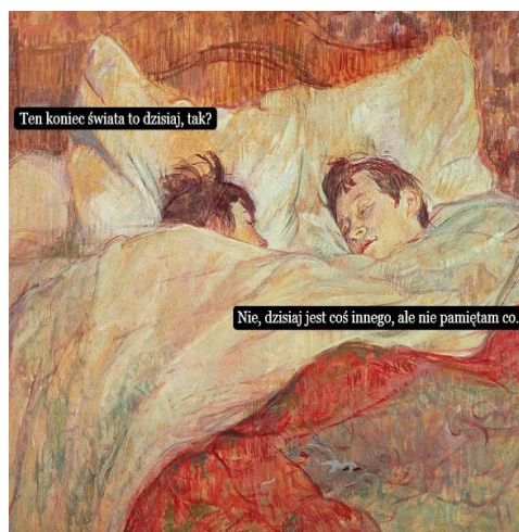
Fig.8. http://culture-flow.blogspot.com/2012/12/sztuczne-fioki.html [access: May 2016]