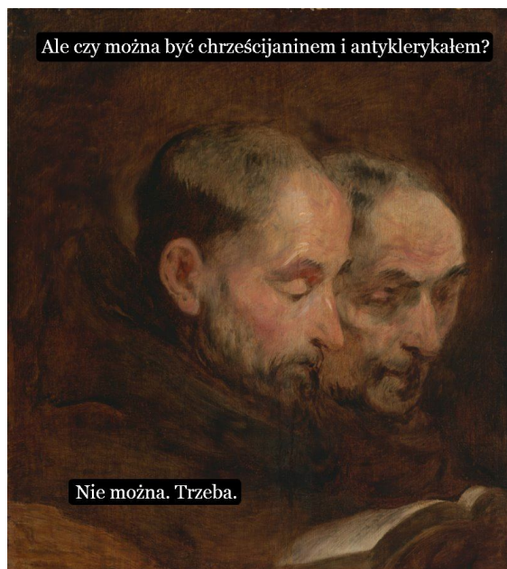
Fig. 3. Meme published at: https://www.facebook.com/SztuczneFiolki/photos/a.483789074973669.115138.483774998308410/821363627882877/?type=1&permPage=1 [access: May 2016]

with negative attitude to the capitalist world and continuously sceptical about the situation in Poland. This is reflected e.g. in the following memes, published among many other texts commenting on current events (changes in open-ended pension funds, burnt rainbow in capital city Plac Zbawiciela square, gender debate in Poland).