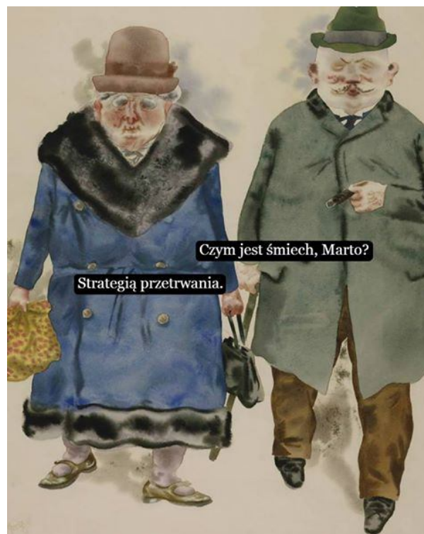
Fig.7. https://www.facebook.com/SztuczneFiolki/photos/pb.483774998308410.-2207520000.1409602911./638153552870553 [access: May 2016]