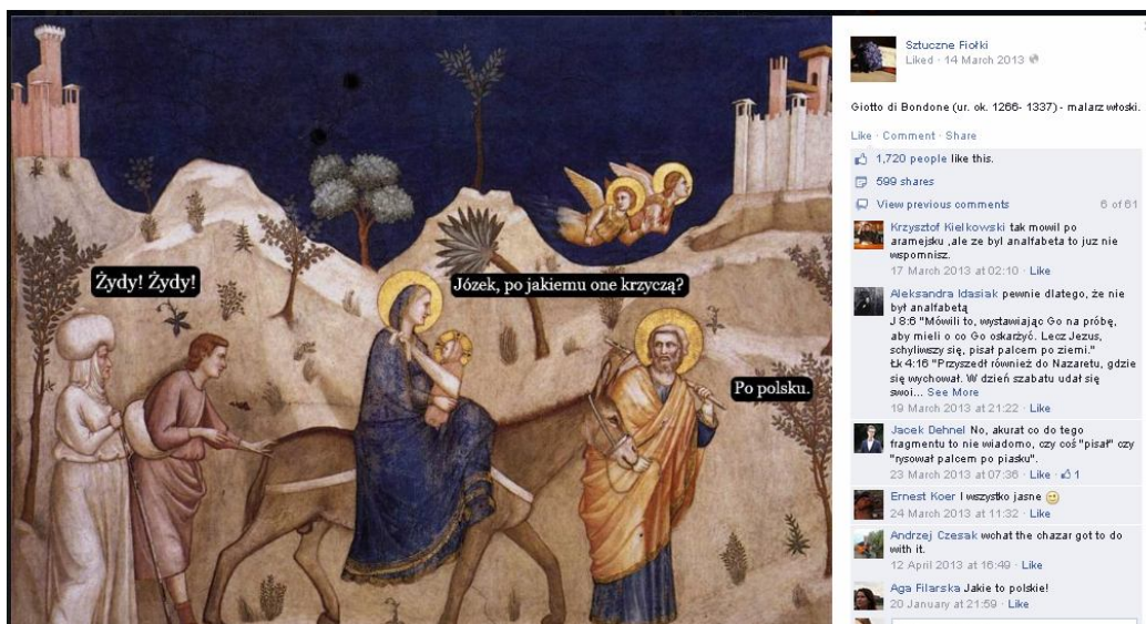
Fig. 12. https://www.facebook.com/SztuczneFiolki/photos/a.483789074973669.11518.483774998308410/677990672220174/?type=1 [access: May 2016]