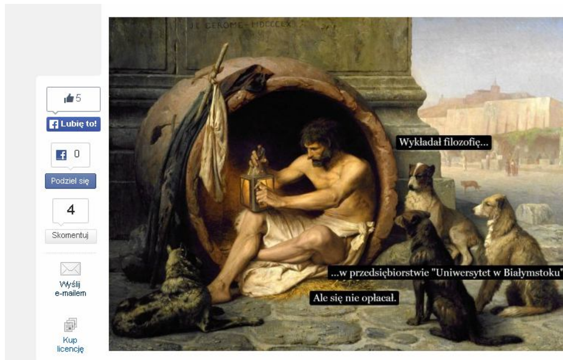
Fig. 2. Meme published at: http://bialystok.gazeta.pl/bialystok/1,35241,15498803,Sztuczne_Fiolki__Mam_w_sobie_duze_poklady_wscieklosci.html [access: May 2016]

with a new author. It is as if we considered a person quoting someone the author of the quote” (Łagodzka, 2014). Hence, a meme found outside of the Facebook platform is deprived of its typical publication framework (the text frame), which signals the proper interpretation of the Facebook art meme.