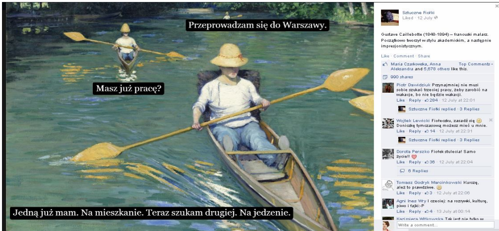
Fig. 10. https://www.facebook.com/SztuczneFiolki/photos/a.483789074973669.115138.483774998308410/812056238813616/?type=1 [access: May 2016]