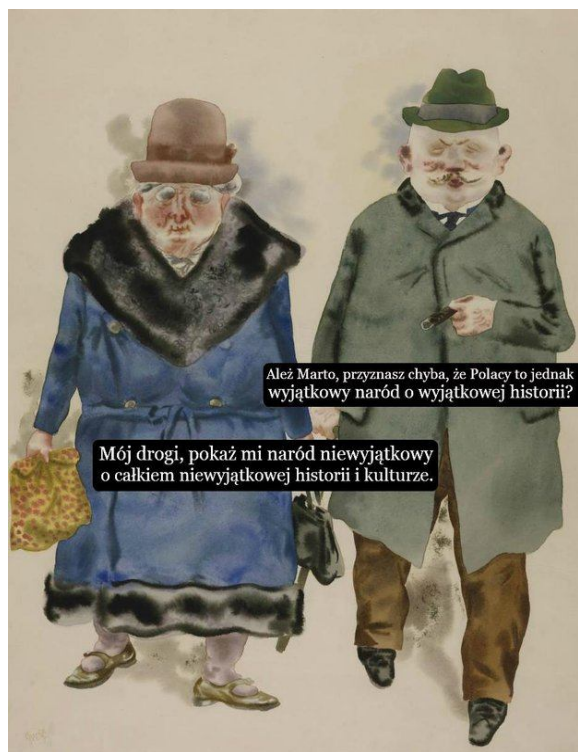
Fig.6. http://wiadomosci.onet.pl/prasa/sztuczne-fiolki-narzecanie-na-swoj-kraj-to-takze-forma-patriotyizmu/j6td4 [access: May 2016]