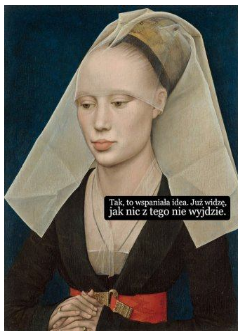
Fig. 4. Meme published at: https://www.facebook.com/SztuczneFiolki?fref=ts [access: May 2016]