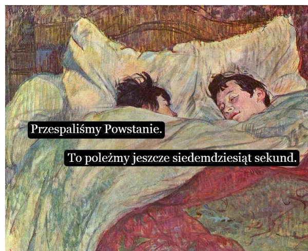
Fig.9. https://www.facebook.com/SztuczneFiolki/photos/a.483789074973669.115138.483774998308410/82204369148204/?type=1&permPage=1 [access: May 2016]

Marta is one of the most frequently recurring characters of the posts and seems to be the author's alter ego. The sender has an educational mission, but it is not about promoting art in the mass media. The sender offers critique in the form of a Facebook art meme, which evokes the values of the Enlightenment. As the author explains: "I have recently come to the conclusion that