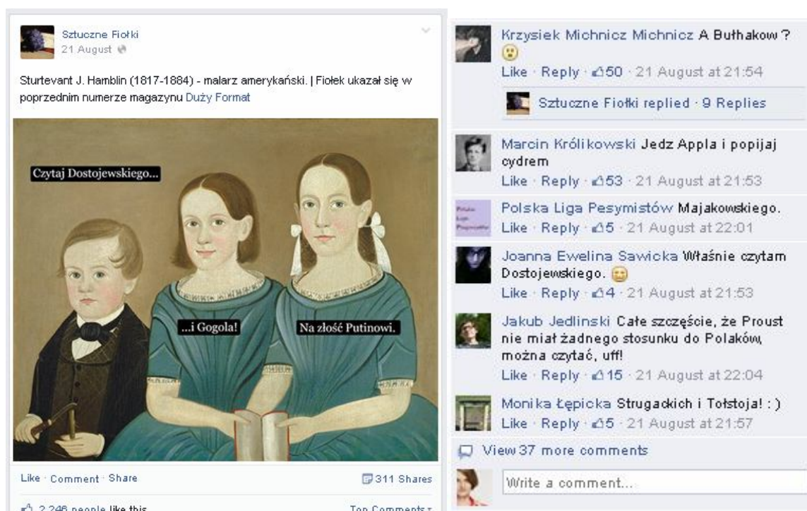
Fig.1. Meme published at: https://www.facebook.com/SztuczneFiolki/photos/a.483789074973669.115138.483774998308410/831703326848907/?type=1 [access: May 2016]

the information on the sender, delivered by the system (1), followed by the author's comment (2) and an additional element in the form of an image or some other multimedia material (3). The last element, provided by the system, is the date of publication with comment and share options (4), so that users can engage in a dialogue with the author. Below, one will find an example from "Sztuczne Fiolki" – the micro-post refers to the social campaign called "Eat apples to spite Putin", propagated by the media after Russia's embargo on Polish fruit and vegetables in August 2014.