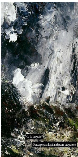
Fig. 5. Meme published at: https://www.facebook.com/SztuczneFiolki/photos/a.483789074973669.115138.483774998308410/731349956884245/?type=1&theater [access: May 2016]