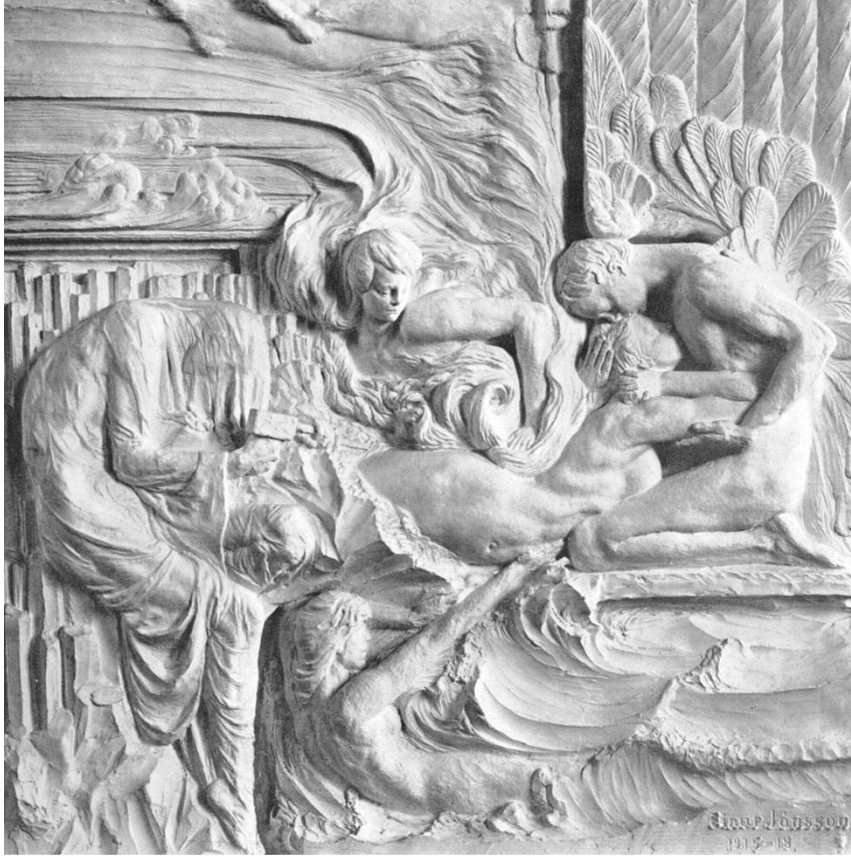
Fig. 7. Einar Jónsson, The Birth of Psyche , Courtesy Einar Jónsson Museum in Reykjavik.