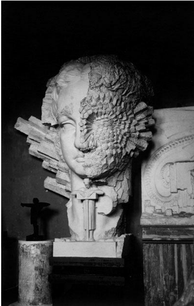
Fig. 8. Einar Jónsson, The Rest , Courtesy Einar Jónsson Museum in Reykjavik.