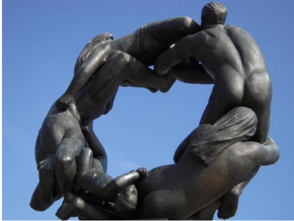
Fig. 1. Gustav Vigeland, Wheel of Life , The Vigeland Park in Oslo, photo: M. Stępnik