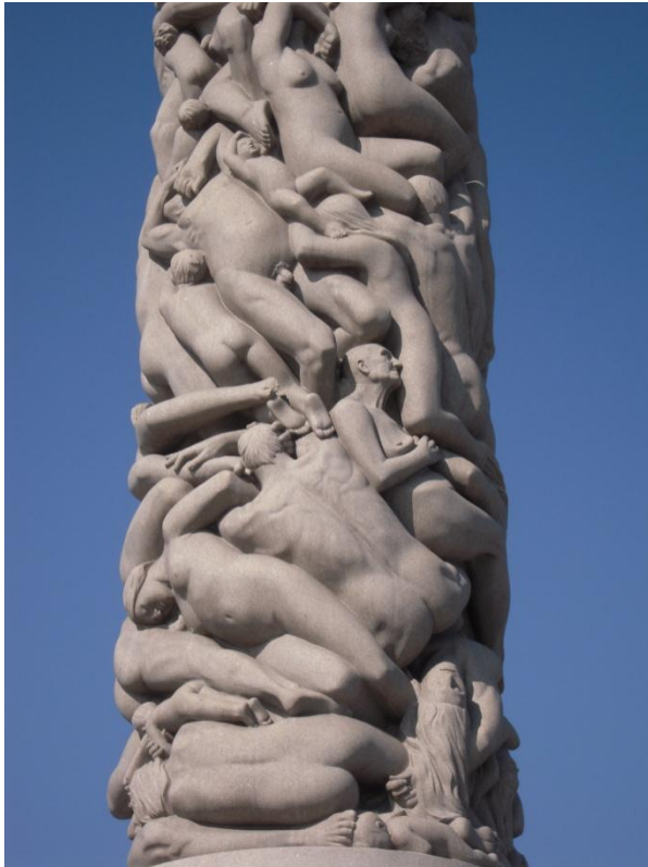
Fig. 2. Gustav Vigeland, The Monolith (detail), The Vigeland Park in Oslo