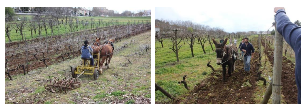
Figure 3. Animal working in vineyards

Working vines with animals never totally disappeared. It is the case of old vineyards producing a high value output with short plant spacing or in terraces or steep slopes, turn animal traction without alternative (Figure 3). That is happening in Douro River Valley (Oporto wine producer region) in Portugal, in France - Burgundy or Bordeaux regions, or in Spain - Ribeira Sacra region.