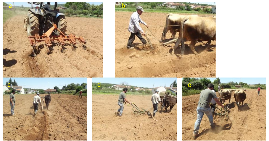
Figure 2. Cultivator pulled by tractor (a); Roman plough pulled by cows (b) and by donkeys (c); Cultivator pulled by donkeys (d) and by cows (e).

The research mentioned, carried on by García-Tomillo et al (2017), aim to compare tillage operations performed with two types of draft animals, cows (a pair) and donkeys (a pair), focusing on the effects on soil physical properties related to soil compaction, and testing the performance of Electrical Resistivity Tomography (ERT) in detecting changes in soil physical properties affected by tillage treatments.