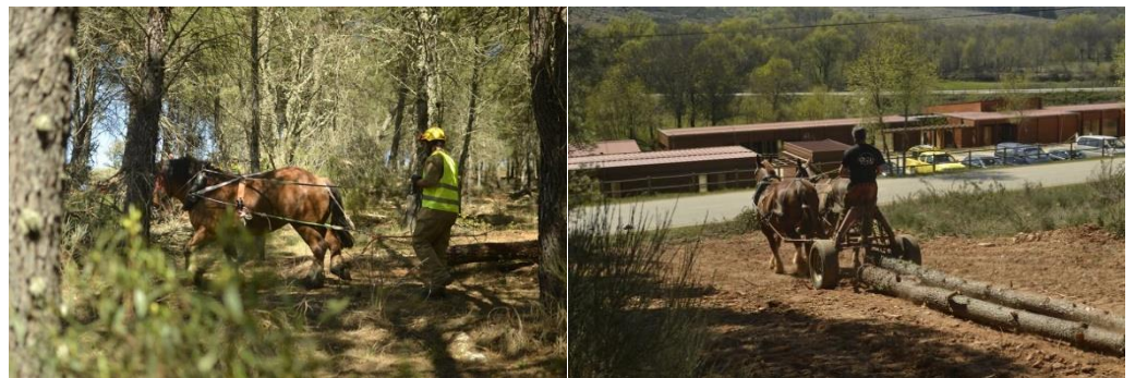
Figure 1. Horse skidding in forest (APTRAN).

Draught horses represented an advantage in low-intensity cuts, in short extraction distances or when pre-existing trails are not available.