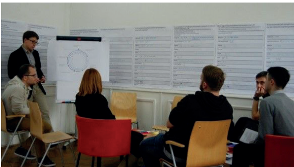
Figure 6: The checklist as a 'silent participant' ready to be brought up