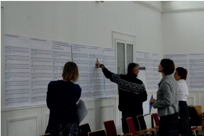
Figure 5: A discussion over answering the questions from checklist

Once completed, the checklist stays there . Thanks to its availability, it becomes an object and an incentive for constant commentaries in public (Figure 6). Particularly, the moderators have a great tool at hand: a complete checklist provides a host of examples at a glimpse of an eye whilst, at the same time, indicating the exact places and solutions that require some reconsideration. The moderators can illustrate the claims presented during the seminar and specify parameters of the hinterland for running the seminar and other future activities in the project.