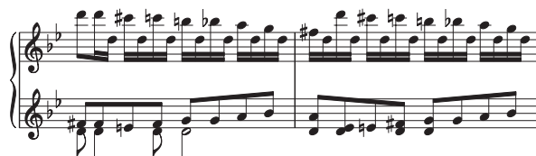
Example 7. Sonata in B flat major , 1st movement b. 121–122

Among rarities can also be counted the right-hand leaps that surpassed an octave (e.g. a tenth: Sonata in B flat major , 1st movement, b. 188; two octaves; ibid. 1st movement b. 189), or broken octaves, in fact absent from Janiewicz's piano music. Dyads in the right hand came as sporadic means — they were mostly thirds, sixths, or, in passing, other intervals, whereas the octaves were truly exceptional and transient (e.g. at some points of the 2nd movement in Sonata in B flat major b. 8/9). The more sophisticated devices present on a large scale in Beethoven's compositions from the Bonn period, involving methods of thickening the texture with tremolos, repetitions, or trills, to name but a few, are very uncommon for Janiewicz's piano music. The rare complex devices he did implement include a chromatic passage downwards with an auxiliary note d in b. 121–122 in the 1st movement of Sonata in B flat major and some lines from the variations Hope Told a Flattering Tale which are described below.