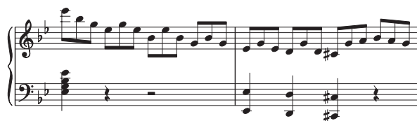
Example 6. Sonata in B flat major , 1st movement b.145–146

Among rarities can also be counted the right-hand leaps that surpassed an octave (e.g. a tenth: Sonata in B flat major , 1st movement, b. 188; two octaves; ibid. 1st movement b. 189), or broken octaves, in fact absent from Janiewicz's piano music. Dyads in the right hand came as sporadic means — they were mostly thirds, sixths, or, in passing, other intervals, whereas the octaves were truly exceptional and transient (e.g. at some points of the 2nd movement in Sonata in B flat major b. 8/9). The more sophisticated devices present on a large scale in Beethoven's compositions from the Bonn period, involving methods of thickening the texture with tremolos, repetitions, or trills, to name but a few, are very uncommon for Janiewicz's piano music. The rare complex devices he did implement include a chromatic passage downwards with an auxiliary note d in b. 121–122 in the 1st movement of Sonata in B flat major and some lines from the variations Hope Told a Flattering Tale which are described below.