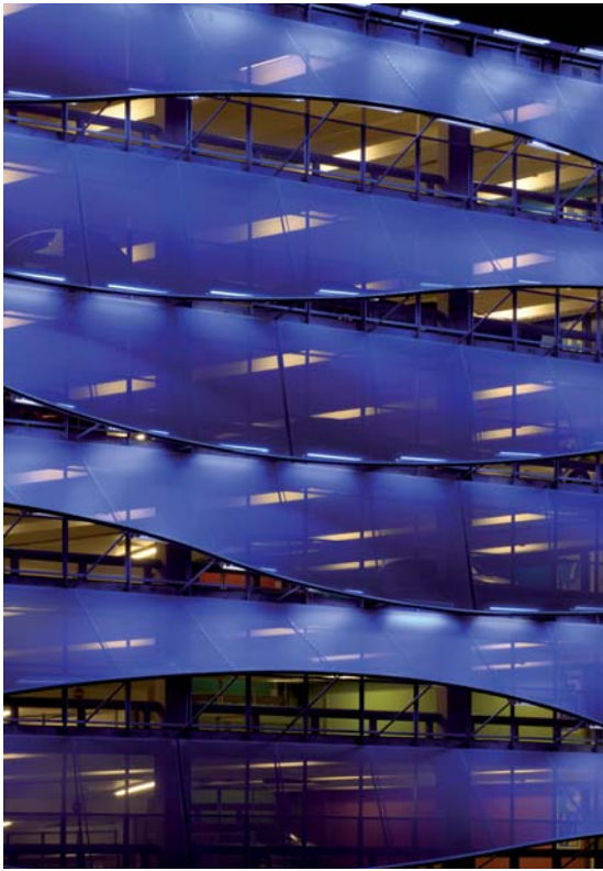
Acclaimed as "the coolest car park in Cardiff Bay" with waves of blue light washing across the facade, the structure measures over 100 meters long, covering the facade of six floors and has become a landmark in the city.

ces tend to 'drop out' when dimming in cold weather environments. By carrying out extensive research studies and lighting calculations, older but more thermally stable T8 lamp technology was applied.