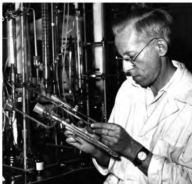
FIG. 1. Prof. Dr. Otto Wichterle (1913–1998) [4]

Because research activities had been blocked during the German occupation, Wichterle joined the research institute of the company Bata in Zlín, which was the world's biggest manufacturer of shoes at that time. During his time at Bata he kept busy developing synthetic fibers, predominantly Polyamide 6. His work was significantly important for the international reputation of the Czech industry: 1941 Wichterle developed the first polyamide fibers, which were suitable for spinning. Industrial production under the name Silon was delayed for 10 years because on one hand this invention was kept as a secret by the German Occupation, on the other hand because of post war problems of the Czech industry.