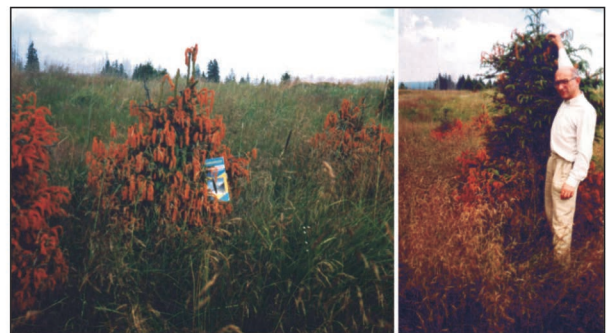
Photographs 2 and 3. Damage to spruce trees after the frost episode of July 20–23, 1996, at mountain dale Hala Izerska in the Izera Mountains, near the estuary of Jagnięcy Potok.