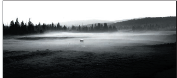
Photograph 1. Radiation fog at mountain dale Hala Izerska, the Jagnięcy Potok measurement station (825 m), view towards direction North-North-West (June 4, 1999).

Intense minimum air temperature drops below 0°C in the middle of summer are very disruptive to the vital functions of forest ecosystems. Damaged and weakened tree stands are more susceptible to the effects of biotic factors, which in turn can lead to complete die-off.