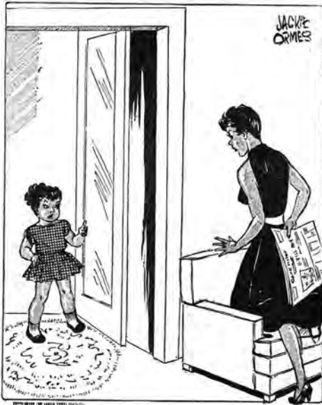
"I don't want to seem touchy on the subject . . . but, that new little white tea-kettle just whistled at me!"