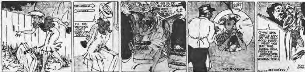
Sept. 4, 1938