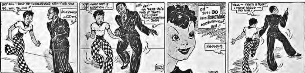
Jan. 2, 1938