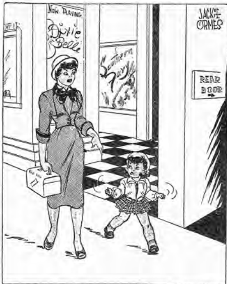
"It would be interestin' to discover WHICH committee decided it was un-American to be COLORED."