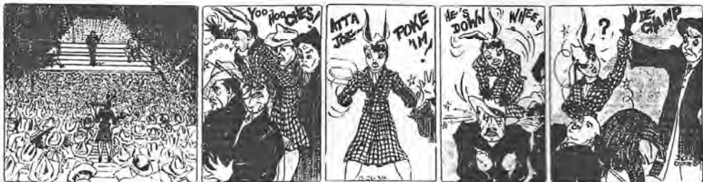
Feb. 26, 1938