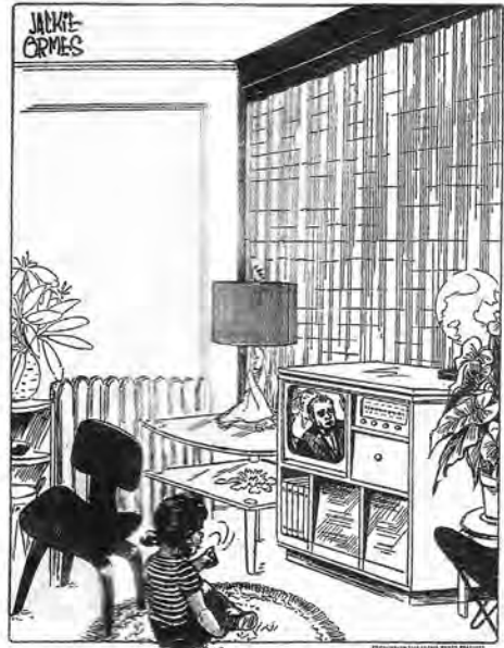
"It's a movie starring CINAMACARTHY again. . .continued from last week."