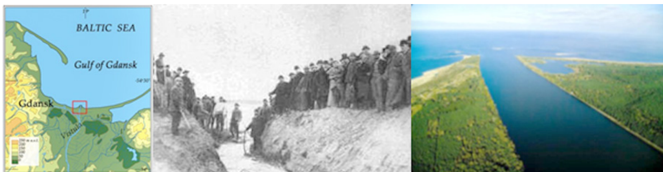
Fig. 1. MLocation of the study area (on the left). Historical photo of the Vistula River artificial channel opening ceremony in 31 of March 1895 (in the middle; source of the photo: www.zulawy.info). Present-day photo of the Vistula River mouth channel (on the right; source of the photo: www.visitzulawy.pl).

about 7000 [m] length, 400 [m] width and up to 10 [m] depth. At the present time, it plays a role of the main Vistula River mouth and due to existing hydro-technical systems situated at the lower reach of the river, about 95% of total Vistula water outflows into the Baltic Sea through this channel (the long-term average annual water discharge reaches 1081 [m 3 /s]). The instability of the channel riverbed within the outlet cone, due to floods and sea storm surges, makes proper management of the river mouth area very problematic and requiring hydrographic monitoring.