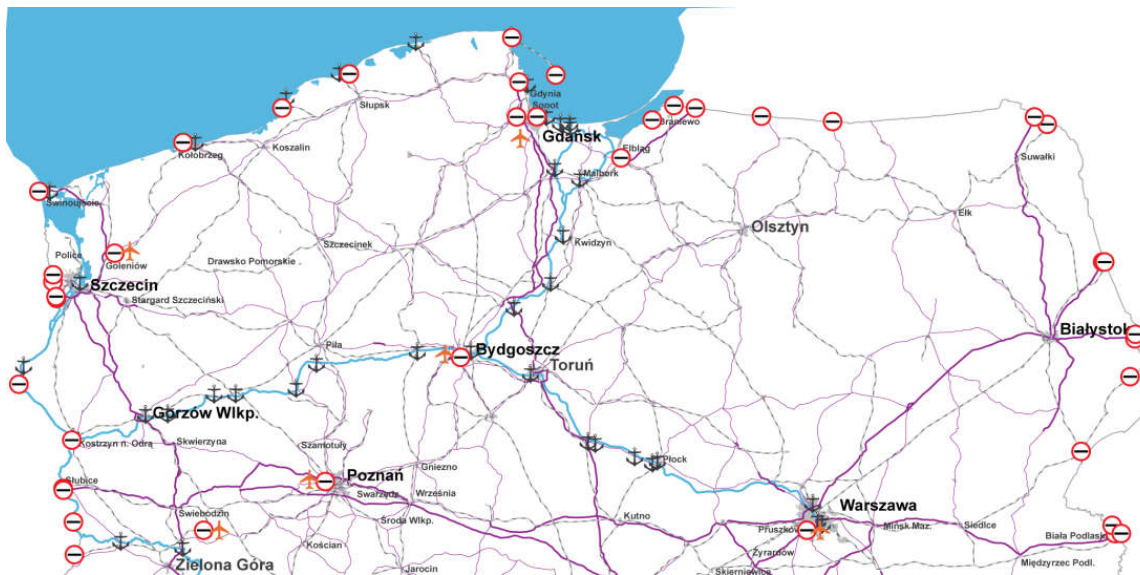
Fig. 3. Transport infrastructure adjusted to OC transport

The process of determining transport corridors began from collecting the maps with the existing roads, rail tracks and inland waterways that are adjusted to accommodate oversize transport, then the point infrastructure was mapped, e.g. sea and inland ports that may become major reloading sites for OC carriage. Then the maps were supplemented with infrastructure to be built or modernized till 2020 and which will be adequate for OC transport (Fig. 3). The next stage was the mapping of potential points of sending and reception of oversize cargo [1].