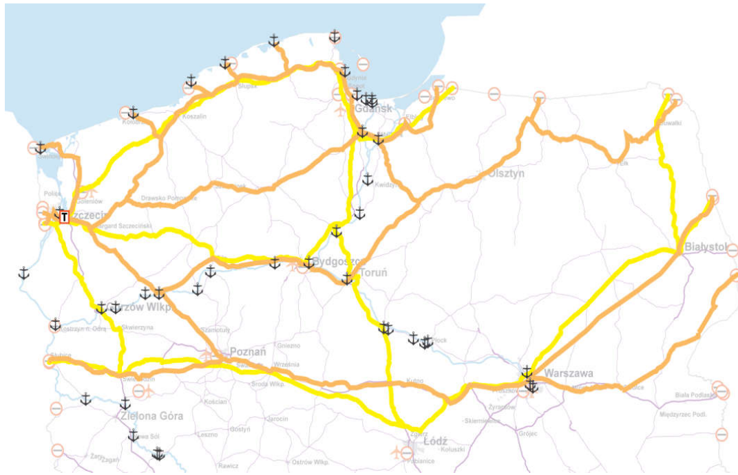
Fig. 4. Intermodal transport corridors for OC transport

OC transport corridors (Fig. 4) were determined by taking into account places where oversized goods are manufactured, places in Northern Poland to which such goods may be sent, the road, rail and waterway networks, potential points of transshipment to other modes of transport [8].