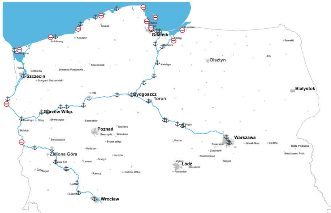
Fig. 1. Sea ports, inland shipping ports and waterways

The restrictions in inland shipping are specified in local law that is issued by the Inland Navigation Office. Limitations are related to the dimensions of the navigable routes, locks and clearance under bridges, pipelines and other devices crossing the waterway, the width of the bridges and the depth of the shipping route.