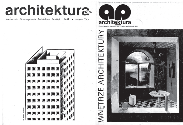
Fig. 1, Fig. 2

In the beginning, the journal focused, to a major extent, on matters concerning the post-war reconstruction, but also wrote about competitions and the designing of the most important buildings erected in Poland at the time, for example the Ministry of State Treasury, the Central Statistical Office or the seat of the socialist party. It should be noted that, over the years, the form and contents of the publication underwent some considerable changes regarding its structure, layout and artwork. These transformations resulted, to a vast degree, from the changes in the social atmosphere marked by several turning points in the history of the PRL. 6 From 1956, which saw the end of socialist realism in Polish architecture and placed the power in the hands of a new government, the magazine's orientation changed significantly by opening up to the achievements and experience of architects not only from the Eastern Bloc, but also from Western Europe and America. 7 A series of texts appeared presenting the latest architectural works in the West, for instance in Sweden, Germany, the USA and the UK. Architektura became an important source of information about the latest trends and realisations, featuring numerous descriptions and examples, for instance descriptions of the national pavilions at the Brussels World's Fair, EXPO 1958. It also included reprints of texts and artwork from foreign magazines like Baumeister and Bauwelt , as well as Italian, British and American publications.