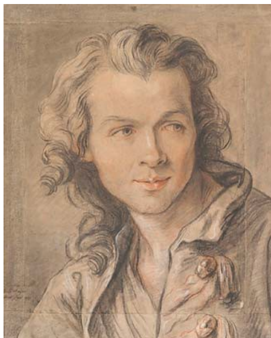
Figure 14: Lemoyne, Jean-Baptiste, Falconet, Etienne-Maurice, 1741 Drawing, Metropolitan Museum of Art

Both Collot and Falconet lived remarkable, closely interwoven lives. She moved in with him at age 16, and aside from a couple of years, lived with him until his death. Both were born poor and achieved considerable acclaim as sculptors, Falconet being ranked among the first rank of sculptors of his era.