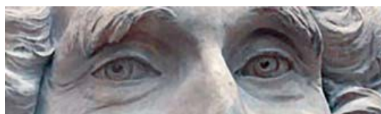
Figures 8 & 9: Falconet, Etienne-Maurice, Camille Falconet,