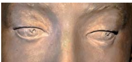
Figure 12: Collot, Marie-Anne, Lady Mary Cathcart, Louvre, 1768, 2014