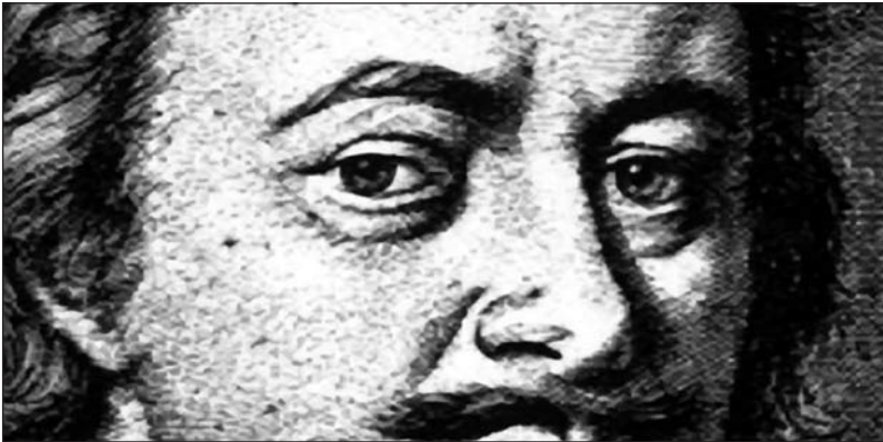
Figure 3: Peter's eyes, detail, from Robert Massie's "Peter the Great", after p. 210