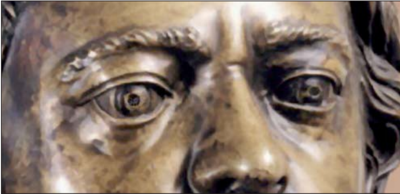
Figure 4: Rastrelli, Carlo Bartholomeo, Peter's pupils' details

lightenment circle and taken her to the Russian Court in St. Petersburg. Her commissions there had made her very wealthy.