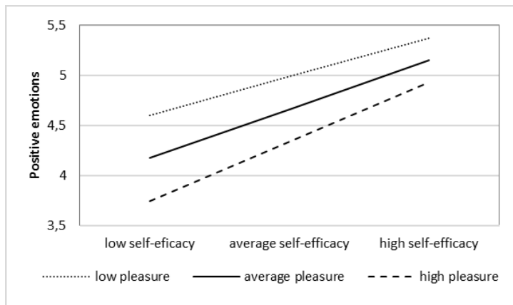
Fig. 2. The effect of learning enjoyment on the relationship between learning self-efficacy and positive emotions.