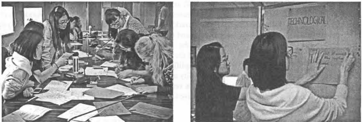
Fig. 3. STEEPVL factors identification – summer school in logistics at the Faculty of Management of BUT 2016

According to the method students were asked to brainstorm for factors determining the NSR in those seven fields. They were divided into groups consisted of students of different nationality. After the individual work they had to present their ideas to their small groups and through the brain storm they were asked to develop 5 factors in the fields dedicated to their group. Finally the groupchairmen presented the outcomes of their work to the whole group (Fig. 3).