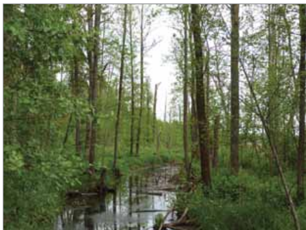
Figure 1. Alder decline along Krynica river in Białowieża forest district

ter discs were removed, and plates with medium were incubated for next 5 days. Every day, plates were investigated, and pure isolates were subcultured on fresh PARPNH medium. Further cultivation of pure cultures was done on V8 agar medium at 22°C.