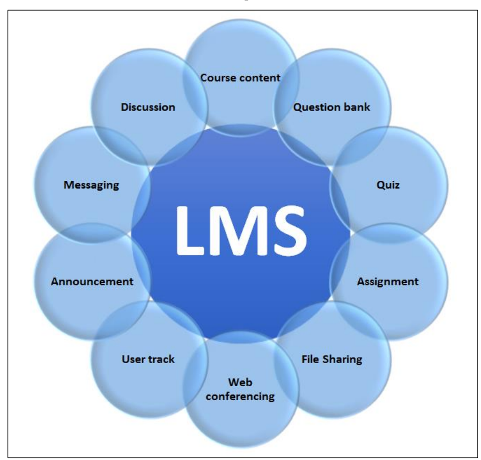
Figure 2. Components of the LMS

Quiz : Using questions in the question database, the instructors can prepare quizzes and present them to their students in groups or individually. The instructors can select the questions, give points to each question, determine the duration as well as start and end date of the quiz. Also the instructor determines whether the students could examine their results and retake the quiz.