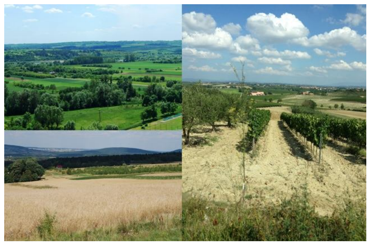
Fig. 1. Agricultural land in Poland (on the left) and in Italy (on the right).

Agricultural properties can be subject to turnover, that is, acquisition, transfer, inheritance etc. as a result of a legal act or a decision of a court or a public administration body as well as another legal event. They can also be subject to one of the processes of property management including, among other things, the surveying division of property. The applicable rules concerning both the legal division of property involving changes in respect of the right of ownership and the surveying division as the physical allocation of a newly planned plot from the original cadastral plot are described below in details.