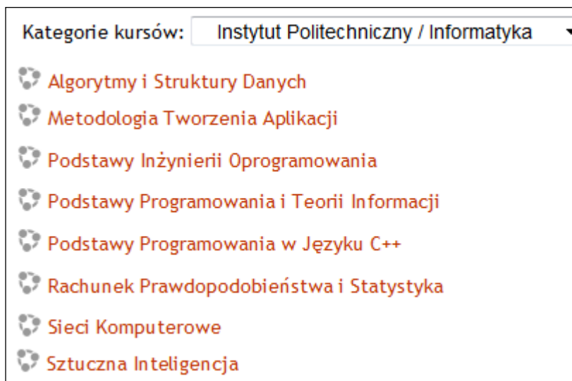
Figure 1. The list of subjects taught by blended-learning method for the students of Computer Science