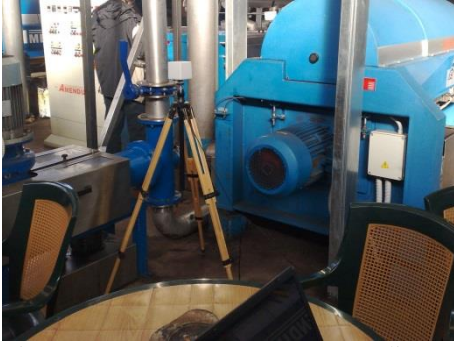
Figure 2. Measurement system standing at test point number 12.