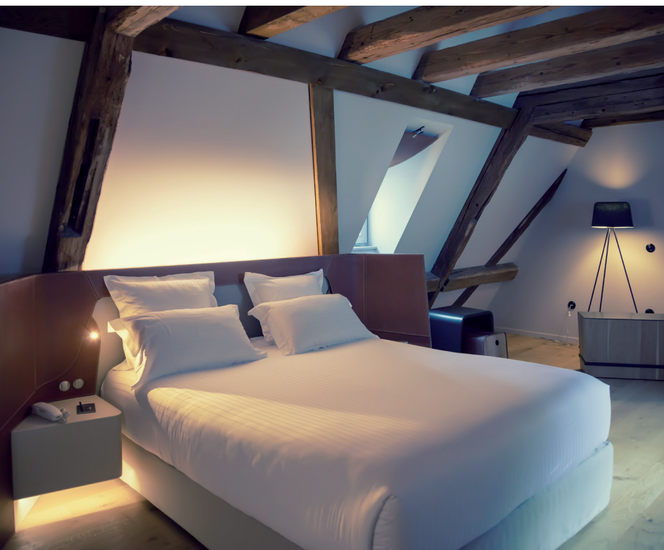
Figure 2 In the early evening, the rule for living room, kitchen and bedroom should be warm white lighting with a colour temperature below 3000K, containing as little blue light in the spectrum as possible.

During the day, we should aim to have natural light via windows and skylights and only supplement with artificial light where there is insufficient daylight available, for instance on gloomy overcast days, after sunset and during winter. In the early evening, the rule should be warm white lighting with a colour temperature below 3000K and it should contain as little blue light in the spectrum as possible. Ideally, at night, artificial lighting should be kept to a bare minimum with a recommendation of light with a spectrum greater than 600nm (amber, amber-red colour). All forms of this lighting at night should be indirect, preferably positioned at a low level, flicker-free and also