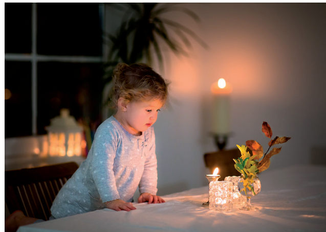
Figure 3 Even with all the latest lighting technology, dinner by candlelight cannot be matched. It creates an ambient atmosphere of warmth, beauty and magic.

My favourite light source for food illumination is still a simple wax candle, although I would recommend it only for special occasions. Even with all the latest lighting technology, dinner by candlelight cannot be matched for an ambient atmosphere of warmth, beauty and magic. Candlelight is very similar to the spectrum of sunset and