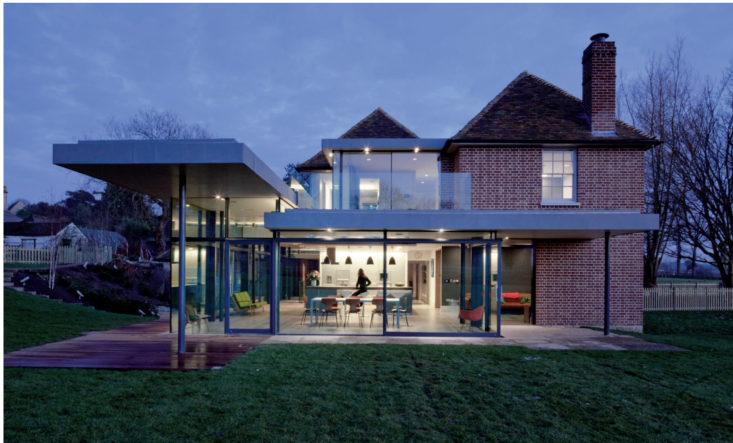
Figure 1 A crucial challenge facing lighting professionals today who design residential lighting schemes, is to provide LED lighting that is both visually safe and harmless to general health.