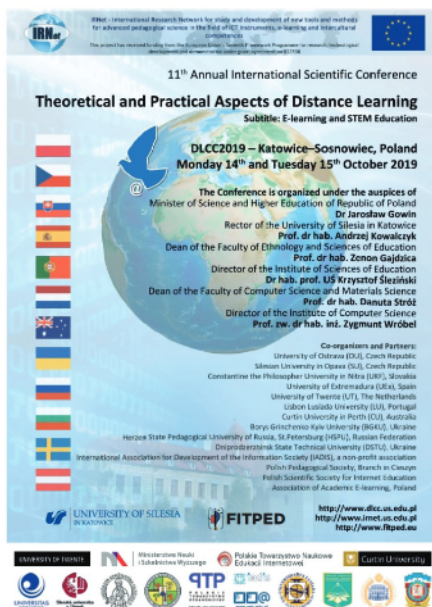
Photo 9. DLCC2019 conference poster