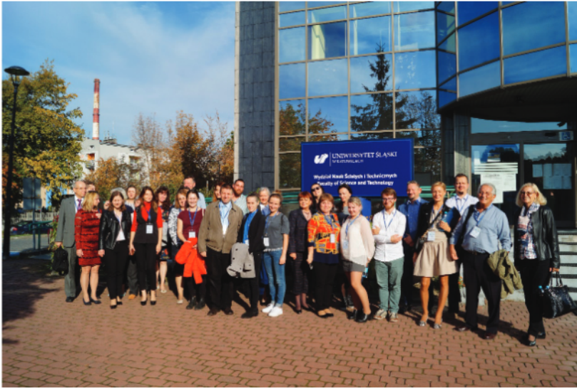
Photo 6. Participants of the DLCC2019 conference