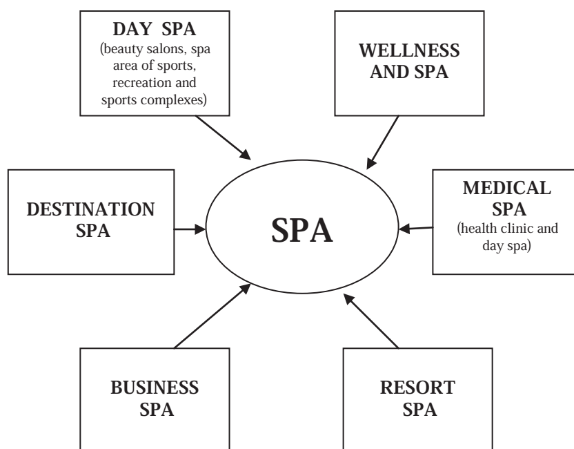
Fig. 5.1. Types of spa.