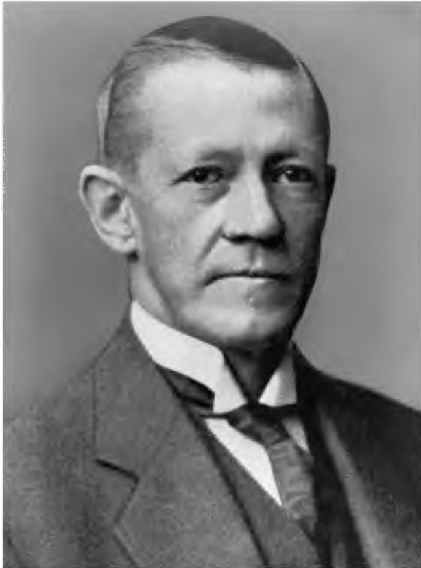
FIG. 1. Prof. Allvar Gullstrand

the methods of physical mathematics to optical images and to the refraction of light in the eye. For his work, he received numerous awards, most important the Nobel Prize in Physiology or Medicine in 1911 1 .