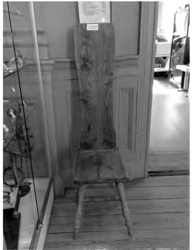
FIG. 3. Allvar Gullstrand's diagnostic chair, now at the Museum for History of medicine, Uppsala (Sweden), www.medicinhistoriskamuseet.uu.se

Gullstrand's theory of physiological optics. Gullstrand applied the methods of physical mathematics to optical images and to the refraction of light in the eye; he was recognized for making the most significant contribution to our understanding of the eye as a refractive organ. Gullstrand investigated also in the mechanism of accommodation; by his research he observed the intracapsular motion of the lens substance during accommodation. Based on his doctoral thesis on astigmatism and on Helmholtz's theories Gullstrand developed his theory of physiological optics. The complete proof of this theory is found in the following three works: Allgemeine Theorie der monochromatischen Aberrationen und ihre nächsten Ergebnisse für die Ophthalmologie (General theory of monochromatic aberrations and their immediate significance for ophthalmology) (1900), which received awards from the Swedish Royal Academy of Sciences and the Swedish Medical Association, Die reelle