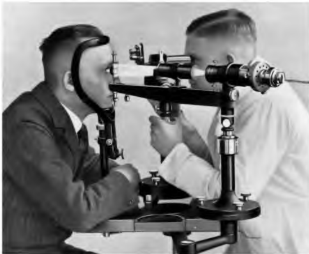
FIG. 4. Examination using nitra slit lamp according to Gullstrand

Beside of all theoretical achievements Gullstrand also invented several instruments which, as mile stones in ophthalmic diagnosis, were and still are highly valuable to ophthalmologists. As Gullstrand contributed numerous achievements to ophthalmology only a selection is shown below to demonstrate his important influence on science, valid even today.